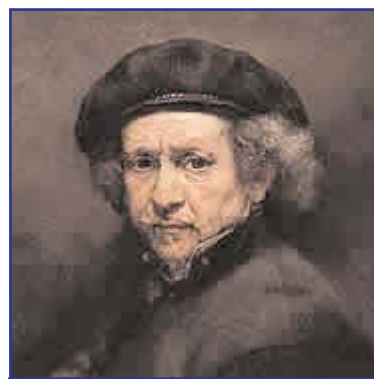
Self-portrait Rembrandt Harmensz van Rijn (1659,)

R embrandt van Rijn is thought to be born on July 15 1606 in Leiden. He was the ninth child of a miller and his family was reasonably well to do. His father wanted him to study at the Leiden University, but after one year Rembrandt left the university to study arts. In 1631, when Rembrandt's work had become well known not only in Holland but all over Europe, he moved to Amsterdam. He became the leading portrait painter of Holland and received many commissions for portraits as well as for paintings of religious topics. His paintings are