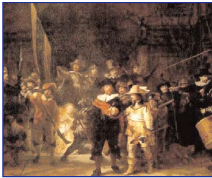
The Nightwatch (1642, The Militia Company of Captain Frans Banning Cocq)

It depicts a group of city guardsmen and each man is painted with the care that Rembrandt gave to single portraits, yet the composition is dynamic and the separate figures are second in interest to the effect of the whole.